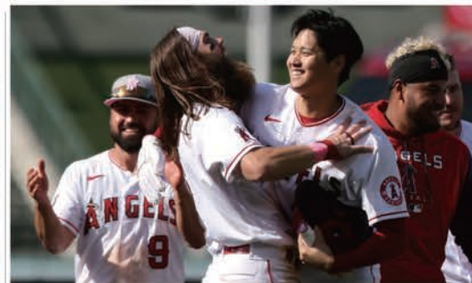
ANGELS EDGE NATIONALS IN ANAHEIM

Through the series of talks, Hayashi hopes to confirm with Yoon's administration that Japan and South Korea will continue to communicate well with each other given that Yoon's side seems to be eager to mend the frayed bilateral relations.